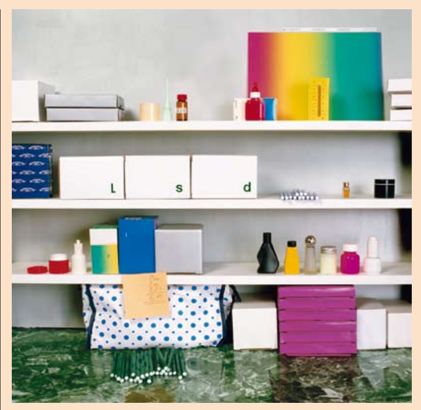
Minilab, 2009 . Colour photograph. 100 × 100 cm