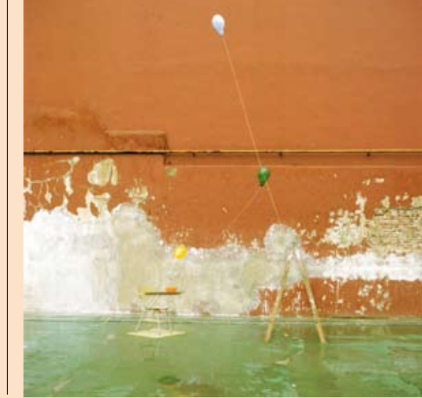
Swinging 'BA, 2004. Mixed-media installation. 4\times6\times4 m