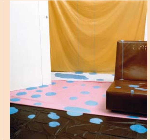
#08 (New Models series), 2006. Colour photograph. 110 x 110 cm

He is searching for verisimilitude while at the same time making the construction of the set obvious, so that his works may be viewed as maquettes or prototypes of reality.