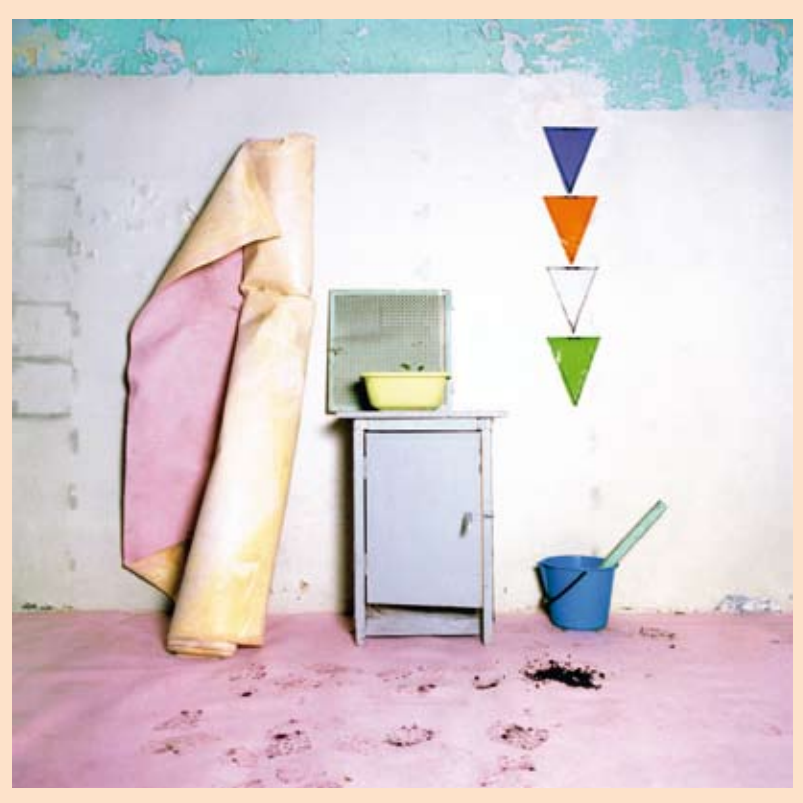
Experimental Vehicle , 2004. Colour photograph. 60 \times 60 cm